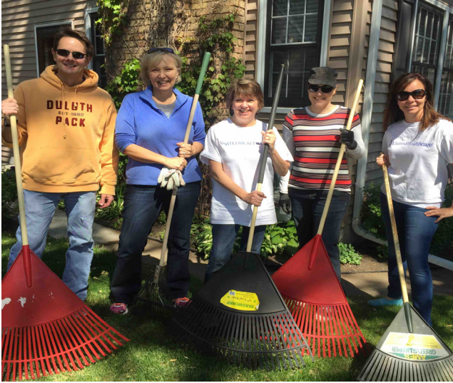
A group of dedicated volunteers from Optum, raking this past spring for a HOME client.

The kindness of volunteers, helped many HOME clients receive assistance with yardwork, painting and other tasks this spring and summer. Many individuals and groups came with happy hearts and willing hands. One client wrote us this note, “The HOME Program is so wonderful, and these super volunteers you sent to my home were exceptional. Please let them know how much I appreciate their generosity, cheerfulness and old-fashioned, hard labor.” Thanks to all the volunteers for their efforts! We hope many will return!