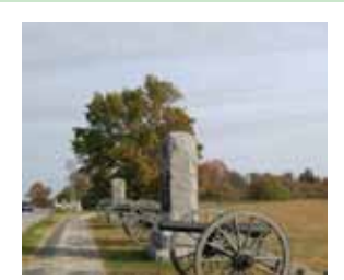
Gettysburg National Military Park