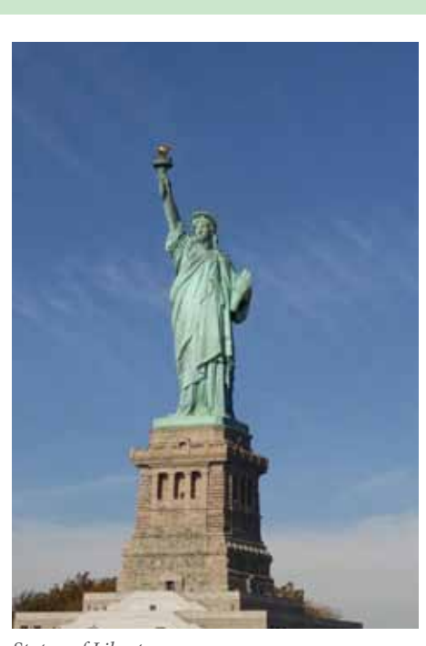
Statue of Liberty

Our morning begins with Mount Vernon. You are invited to tour the mansion house and more than & buggy remains a primary form of National Zoological Park, and nine a dozen outbuildings including the