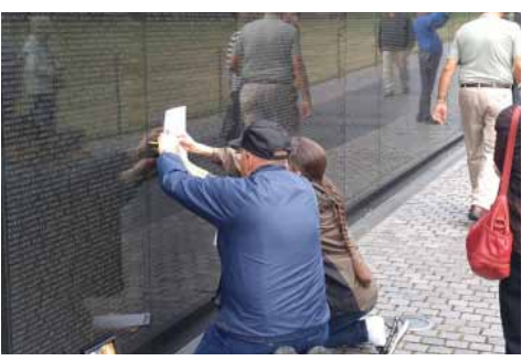
Vietnam Veterans Memorial