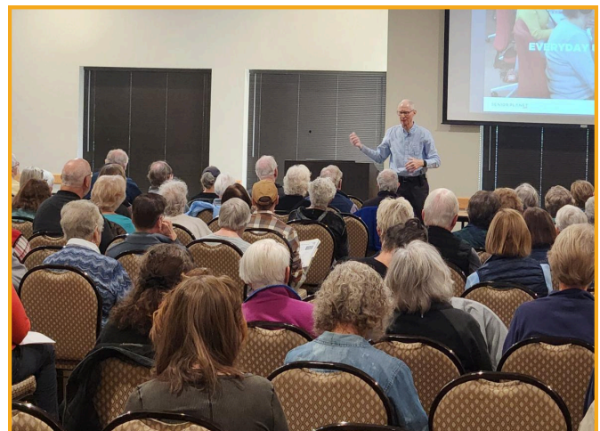
A Technology Coach presenting “Everyday Uses of AI” to over 100 people.